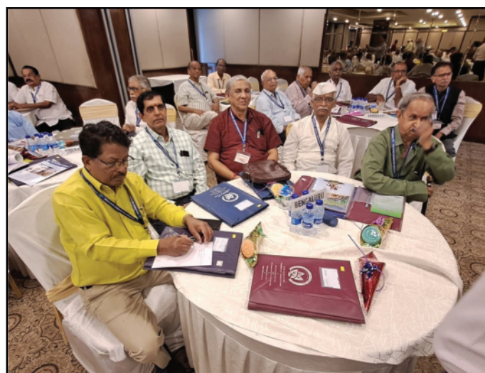
Office bearers of SBIPA(K) attending the Governing and General Body Meeting held at Pune.